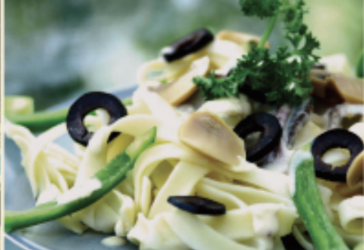
For Healthy Snacks